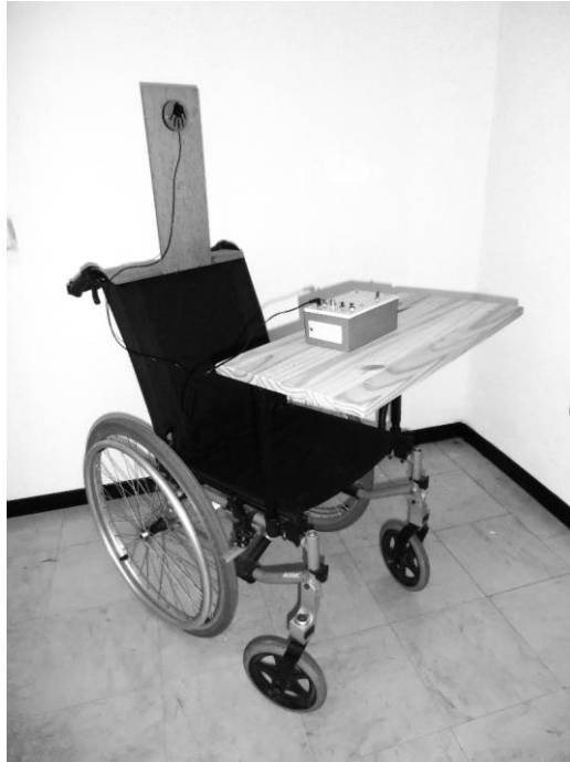
Fig. 1. Speech synthesis commanded by movements of head.

It is based on a sound board that enables to record several messages. Several function modes are planned (Fig. 2).