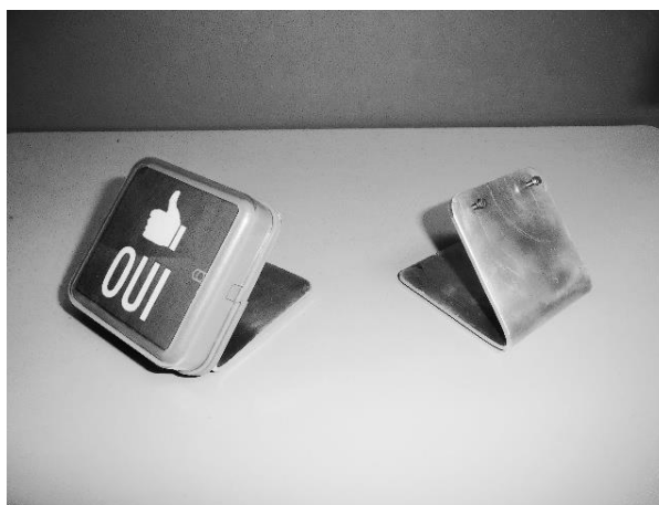
Fig. 4. Slopped contactor support

Nevertheless, even if its use is bad, he understood the casual link. Is it due to nervousity or impatience? Is it about a stereotypical movement engendered by the long-time use of the contactor? At this phase of learning, we can think of "the excitement" of the new material as an important reason. Indeed, this teenager is waiting to show to all that he can use his contactor. However, the young man who uses it seems to have understood the casual link between using the contactor and an emitted sound. Furthermore, he also showed he was able to use the contactor with his wrist.