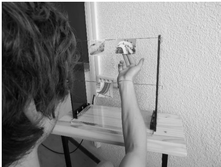
Fig. 3. Designator wire