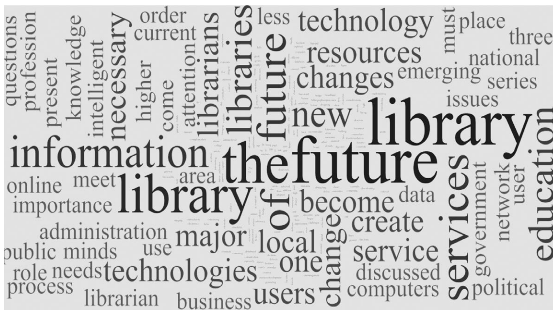
Figure 2: Word cloud of articles on the future of libraries. 1