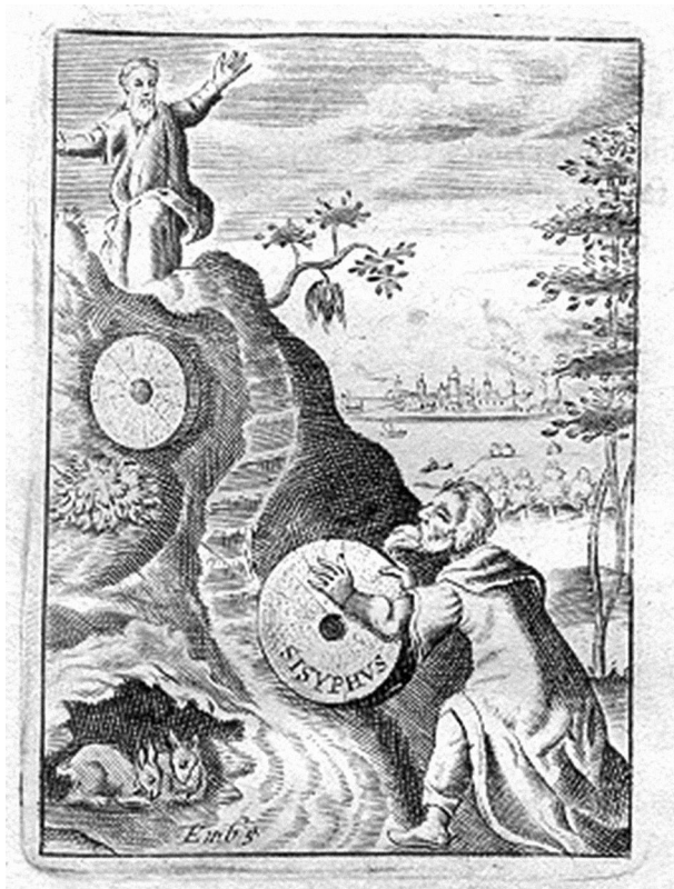
Figure 4: Sisyphus

as a smart library, connected, part of a grid, useful, innovative, creative, user-centred, and urban?