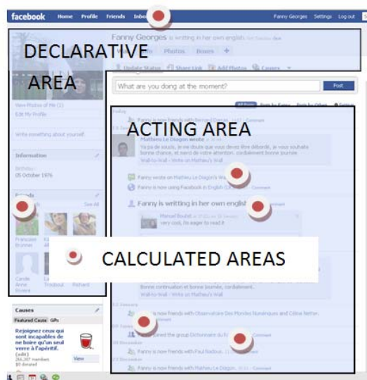
Figure 2 Facebook: declarative, action and calculated areas

As seen in figure 1, the self-representation process is centred on the user representation-shaping process by reflexive dynamics which are linked to consciousness. In figure 1, digital identity is shown as being centred on cultural patterns. These two processes are closely linked, as argued earlier in 1.3. To define the cultural impact of CMC software on the representation of identity, we have to develop a second dimension, based on the self-representation phenomenon and reflected by the local cultural mirror.