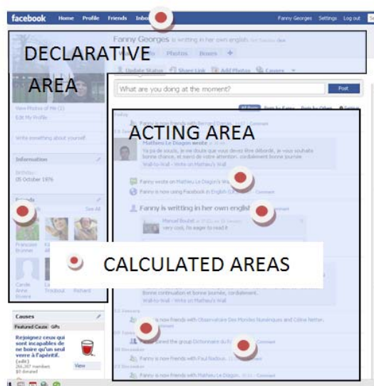
Figure 2 Facebook: declarative, action and calculated areas

As seen in figure 1, the self-representation process is centred on the user representation-shaping process by reflexive dynamics which are linked to consciousness. In figure 1, digital identity is shown as being centred on cultural patterns. These two processes are closely linked, as argued earlier in 1.3. To define the cultural impact of CMC software on the representation of identity, we have to develop a second dimension, based on the self-representation phenomenon and reflected by the local cultural mirror.