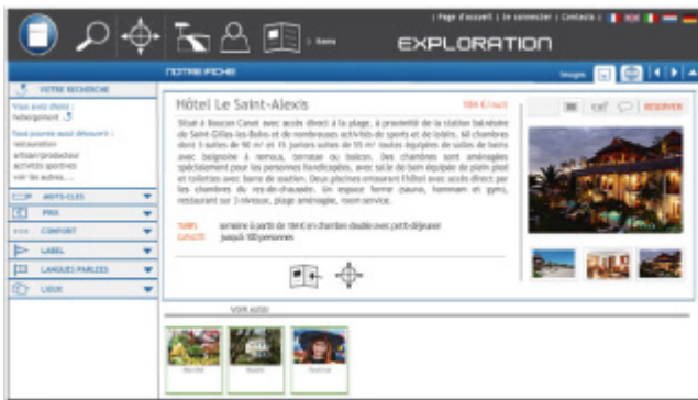
Figure 4. Local view on a resource with suggestions displayed on the bottom part.

As described in the previous section, suggestions are displayed by rollover on a specific item in the case of a result set. They are also displayed when the end-user consults a local view on a resource (see Figure 4).