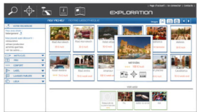
Figure 3. A set of results in image-card mode. On rollover, an image-card gains more visual importance and the resources related to it are displayed in the bottom part.

The particularity of each of the visualization mode proposed is that, by rollover on the different results displayed, the end-user has also the means to visualize this result in the context of the instances it is related to in the knowledge base (see Figure 3).