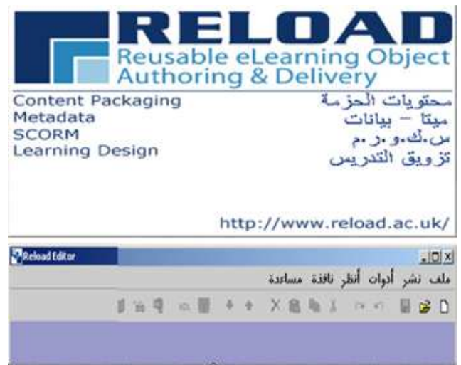
Figure 3. Reload localization to Arabic language

This experience, supervised by one of AUF standards workshop authors, is at its beginning with the localization process. Its objective is to achieve full linguistic and cultural upgrading of the Reload authoring and delivery tool regarding its window interfaces bi-directionality, menu based commands, editing templates, localized calendar and currency use. This will certainly help duplicate localization and translation of this kind of applications and reinforce awareness about standardized learning resources in linguistic environments using other than Latin based languages.