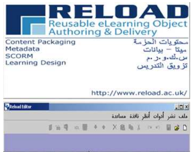
Figure 3. Reload localization to Arabic language

This experience, supervised by one of AUF standards workshop authors, is at its beginning with the localization process. Its objective is to achieve full linguistic and cultural upgrading of the Reload authoring and delivery tool regarding its window interfaces bi-directionality, menu based commands, editing templates, localized calendar and currency use. This will certainly help duplicate localization and translation of this kind of applications and reinforce awareness about standardized learning resources in linguistic environments using other than Latin based languages.