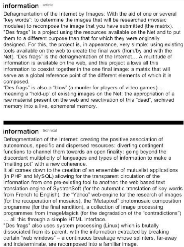
Fig. 2. Screenshot of the Des_Frags artistic and technical information. (© Reynald Drouhin)

If these boundaries of action were crossed during the shared activity of conception, they reappeared in an intensified form in interviews with the artist and the computer programmer post-conception. At the plan's close, desires and often frustrations reemerged, encouraged by the demand of reflexivity inherent in an interview format. So, in the "information" column of the Des_Frags site, the status of the collaborators reemerged as delimited and reinforced by a separation and confrontation of points of view (Fig. 2).