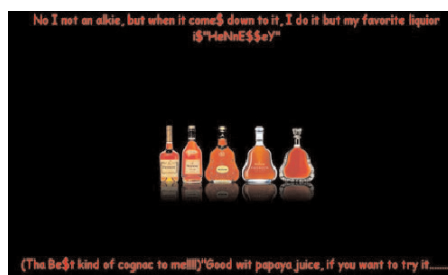
Hennessy: web-based evolution