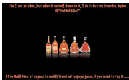
Hennessy: web-based evolution