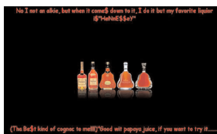
Hennessy: web-based evolution