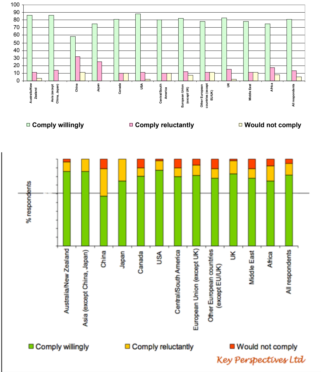
Figure 1: JISC/Key Perspectives Survey of 1296 research authors across disciplines and countries. Asked whether they would comply with a requirement from